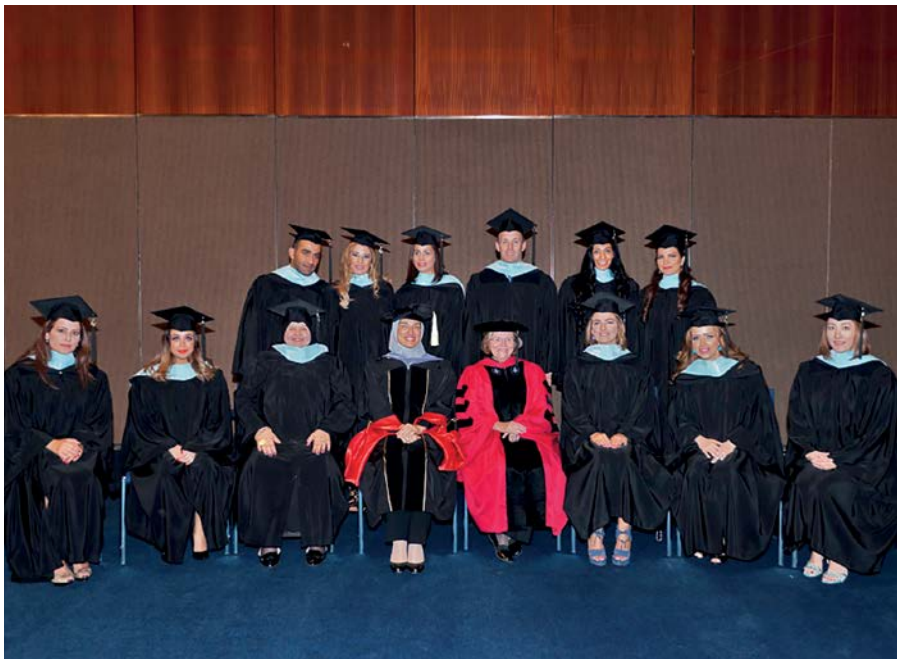
1st Cohort of M.Ed. Graduates Class of 2014